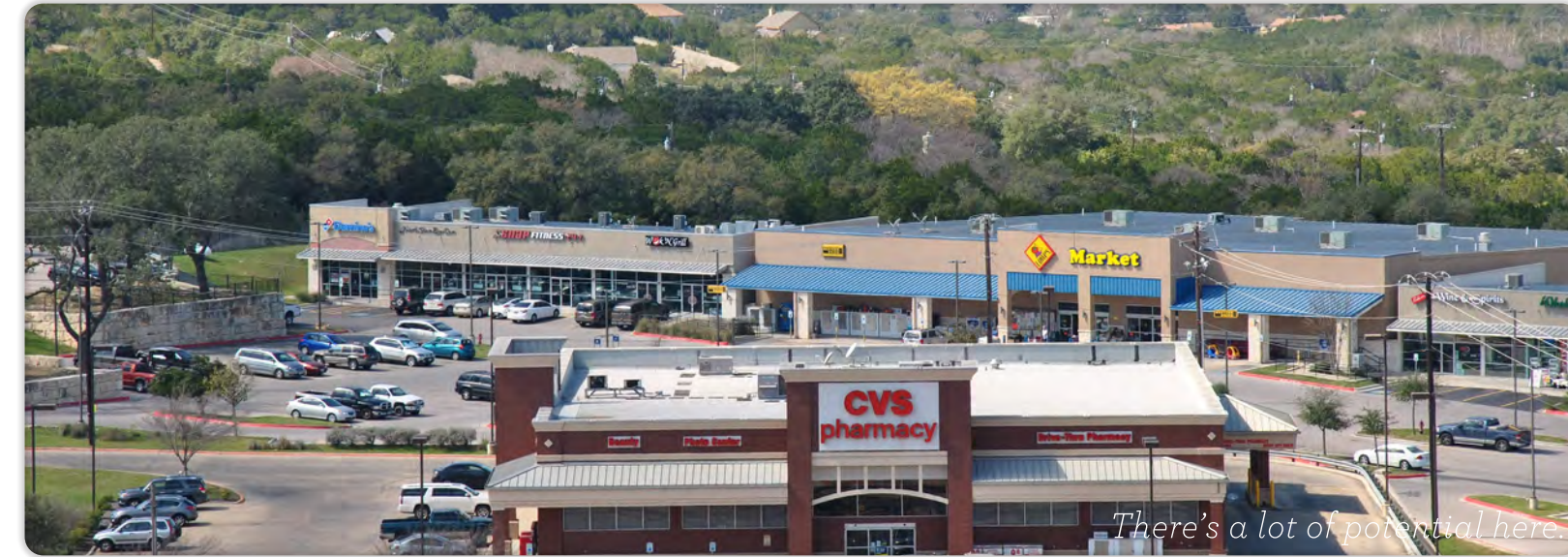
There's a lot of potential here.